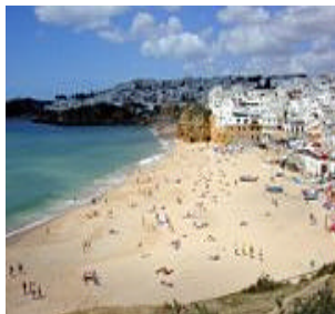
Fisherman's Beach at Albufeira