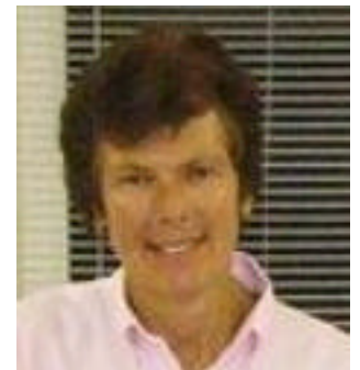
Our fantastic Presidents