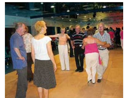
Some dancers from a previous trip to Portugal with Hay's Travel

Watch for the details regarding replacement callers for the time that Jim is away.