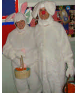
We did have a disappointing turn out, not