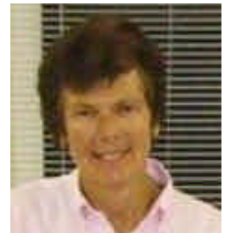
Our fantastic Presidents